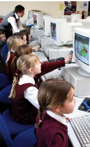
Year 1 children in the ICT Suite

Pre/Post school and holiday clubs – designed to help working parents by caring for their children in happy and familiar surroundings.