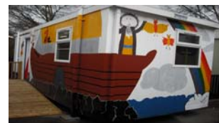
The Noah's Ark Room, our Inclusion Unit.