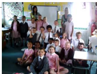
BWI School Council

children have the opportunity to be a buddy if they wish,