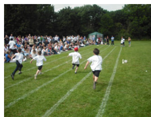
Everyone enjoyed Sports Day